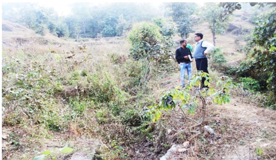
Vegetation/silting in the Do Nadi canal

(iii) In Do Nadi, it was seen during physical verification that there were seepages in dam and accumulation of silt and vegetation in some reaches of canal, causing loss of water flow.