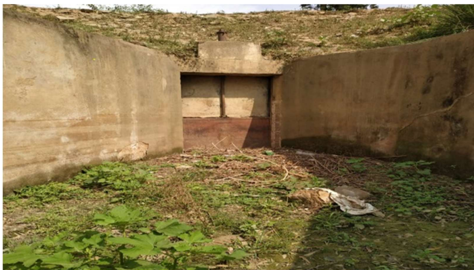
Head sluice at Ghat Pick Up Weir