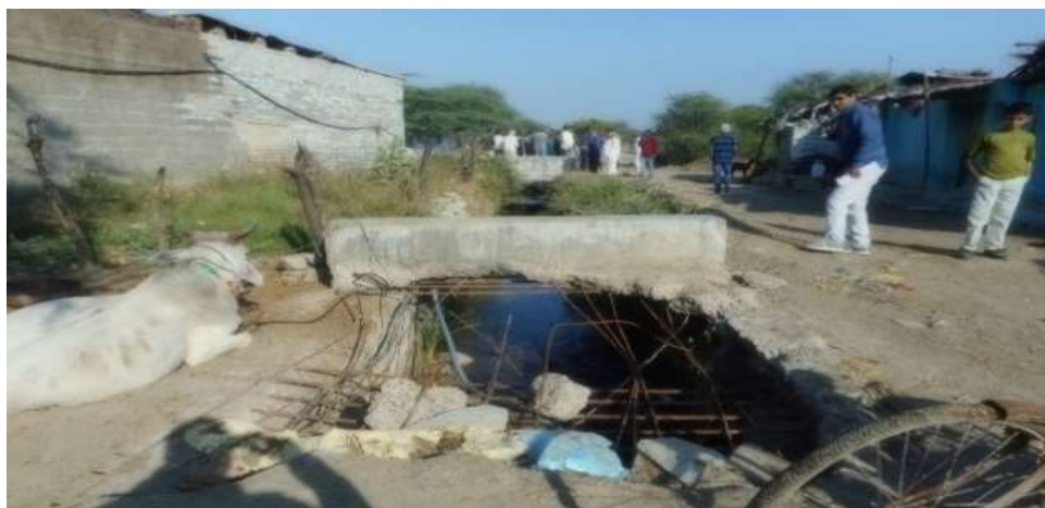
LMC Piplad Project near Amlı Kurd village

(i) In Piplad, Mamtori and Ghat Pick Up Weir, canals were in damaged position at some places. In Mamtori, the broken portion was being used as a path.