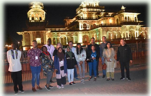
Participants in front of the Albert Hall Museum during shopping at Jaipur (India)

Further, shopping tours to Bapu Bazar, a traditional artisanal market of Jaipur was also organized. Bapu Bazaar is a shopping destination located on MI Road in the heart of Jaipur. It is one of the oldest markets of Jaipur. The market is known for its exotic Rajasthani craft products which include handlooms, handicrafts, brass work and precious stones.