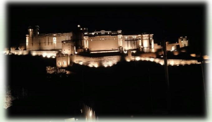
Amber Fort, an eco-tourism site at Jaipur (India)

Trip to Amber Fort Light and Sound Show - The Amber fort has been home to 28 kings of the Kachwaha dynasty until their capital was moved to Jaipur. The sound and light show at Amber Fort is a glorious attempt in reviving the pride, history and traditions of Amber. The show highlights the local legends, folklore, and celebrates the maestros of folk music, who, to this day, continue to give Rajasthan its unique identity.