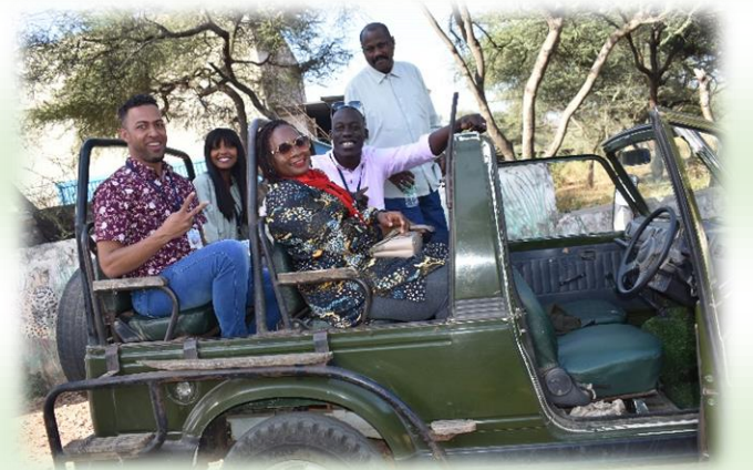
Participants during Bio-Diversity study trip to Jhalana Leopard Safari, Jaipur (India)

It is spread in an area of 23sq km and it is home to 30-35 leopards out of which 6-7 leopards have their territory in tourism area of the park. Situated right in the heart of Jaipur city and close to the Airport, Jhalana slowly is becoming a favourite destination to spot leopards in the wild.