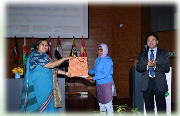
Presentation of certificates to the participants

Further, she distributed participation certificates and mementos to all the participants. She expressed her gratitude to INTOSAI WGEA Finland for their support in this endeavour and thanked European Court of Auditors (ECA) and BPK Indonesia for nominating the resource persons for sharing their experiences with participants. She congratulated the participants and thanked all the SAIs for nominating participants for this programme.