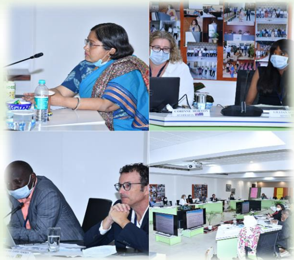
Group Assignment Presentations

Group assignment & Evaluation by experts from SAI India-Group assignment was also given to participants for Country Paper & Presentation. All participants were divided in four groups covering aspects of "Climate Change and its audit".