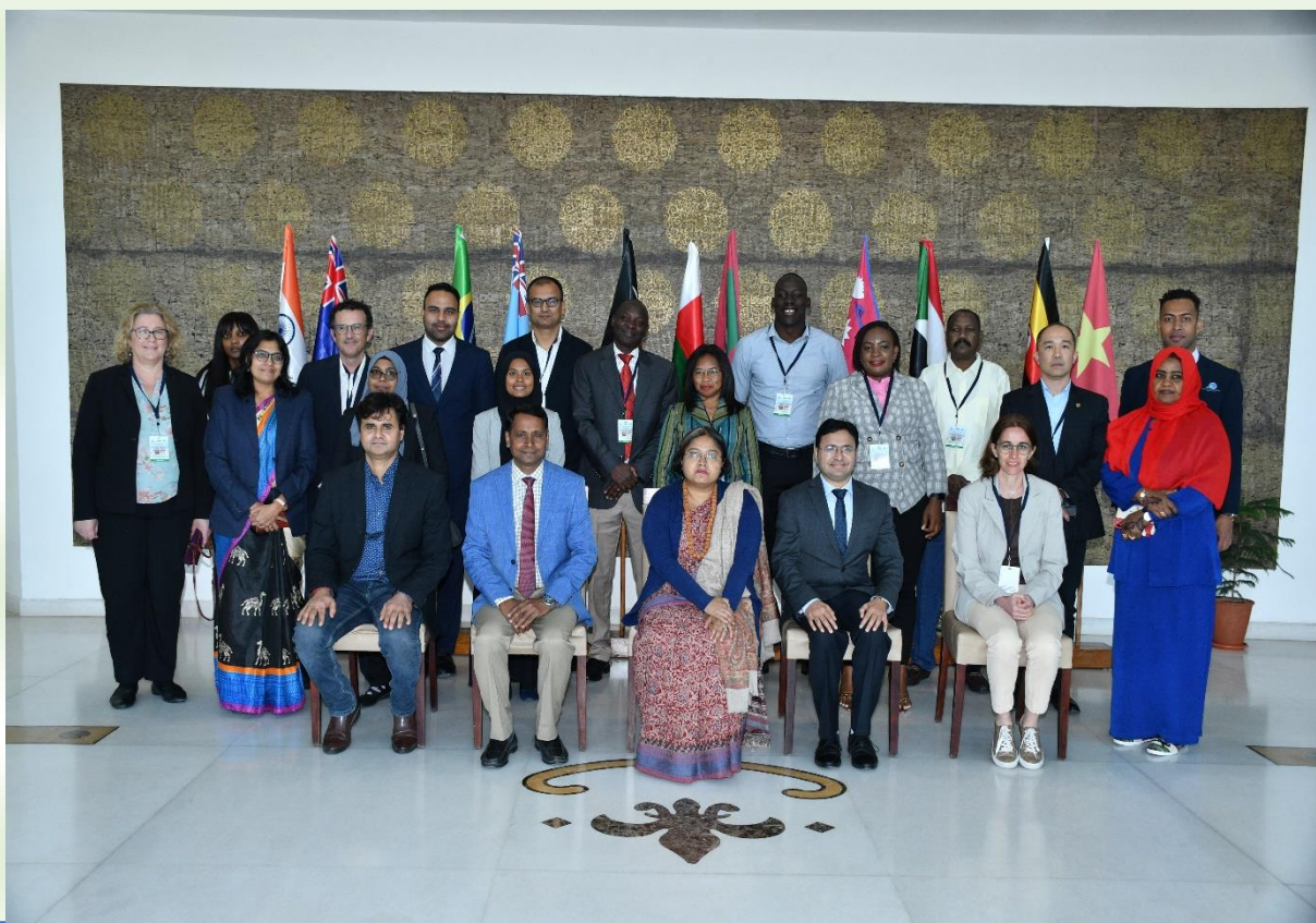
International Workshop on “Climate Change Mitigation and Adaptation Strategies including Green Finance” (13 th to 17 th February 2023)

International Centre for Environment Audit & Sustainable Development (iCED), as the Global Training Facility (GTF) of INTOSAI Working Group on Environmental Auditing (WGEA) organized International Workshop on “Climate Change Mitigation and Adaptation Strategies including Green Finance” from 13 th to 17 th February 2023 at the campus of iCED, Jaipur. A total of 16 participants from 11 SAIs participated in this workshop.