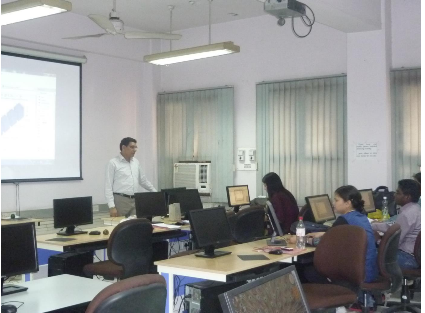
Participants attending IT courses