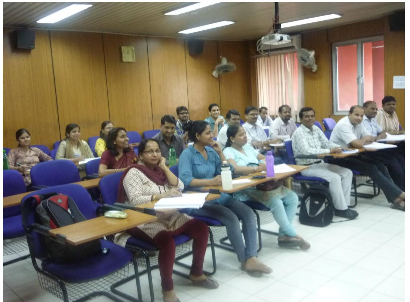
Participants attending General courses